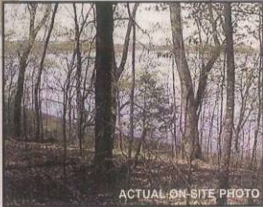
ACTUAL ON-SITE PHOTO

Nestled in an area of lakes and open spaces, Morning Sun is a neighborhood for all lifestyles..