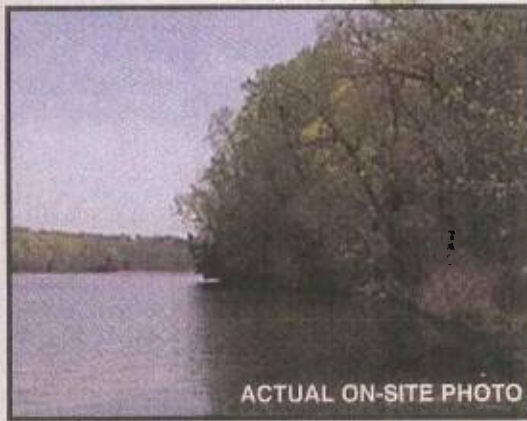
ACTUAL ON-SITE PHOTO

Morning Sun offers a wide variety of housing price and style choices crafted by a quality group of new home builders. Morning Sun has an excellent selection of homesites to meet your most critical requirements.